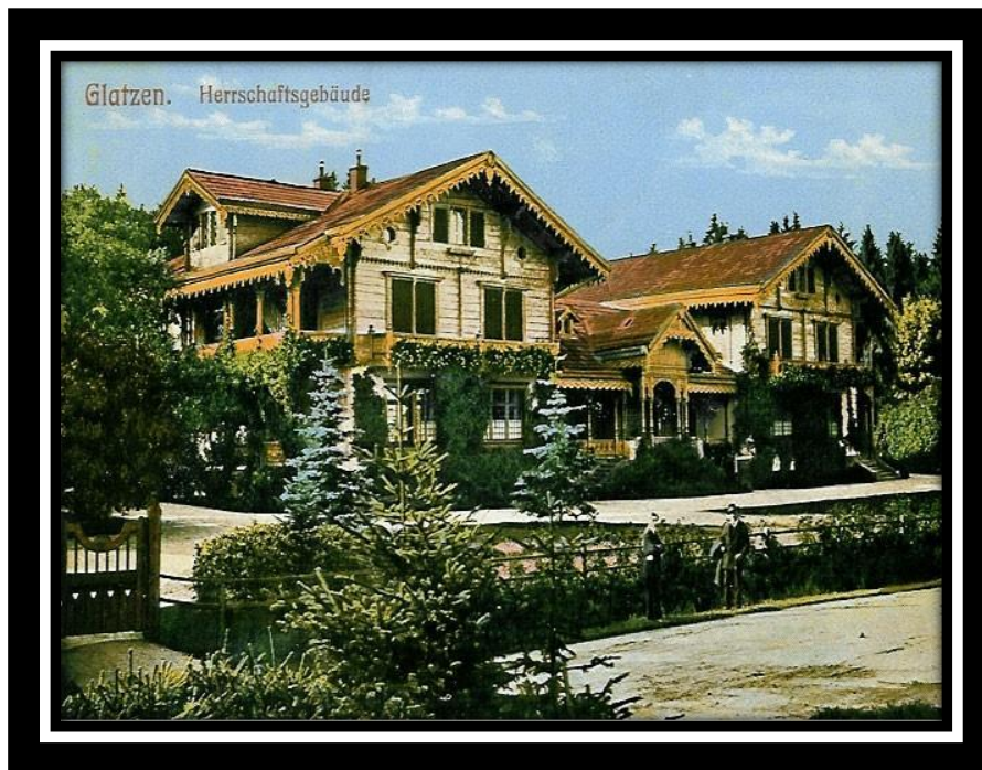
The wood hunting Chateau in an old postcard

We recommend a stay in a wooden hunting chateau surrounded by deep forest and swamp. The area near the hunting chateau was uninhabited for a long time. In the XIX Century a noble man had a hunting lodge erected there and a saw-mill built somewhere near. At the beginning of the XX Century other five Swiss-Tyrol log cabins were built and a local guide book was published for the guests. The park around the lodge was designed in a romantic style with solitary trees in the middle of wide meadows. The park is characterized by its high altitude (around 800 mt. a.s.l.) and by the presence of exotic wood species. Nowadays the wood hunting chateau has 17 rooms well equipped, a central hall with a fireplace and a summer terrace.