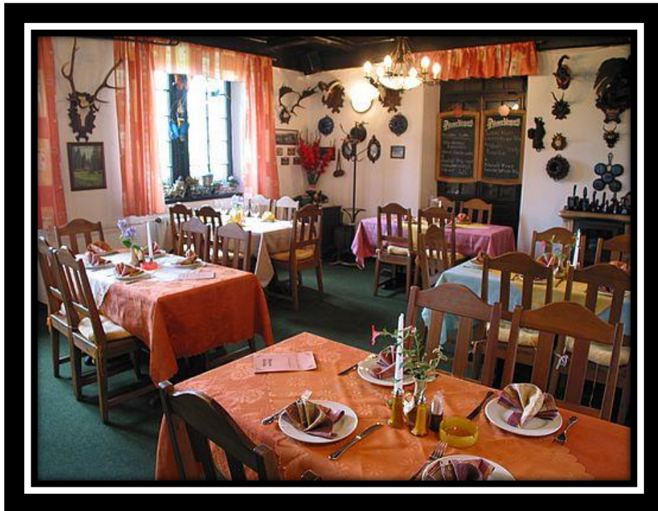
The dining room of restaurant