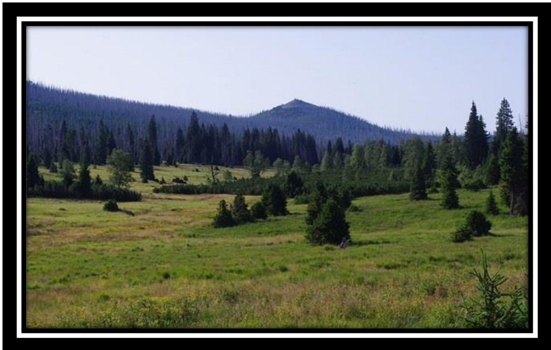
A view of the hunting area